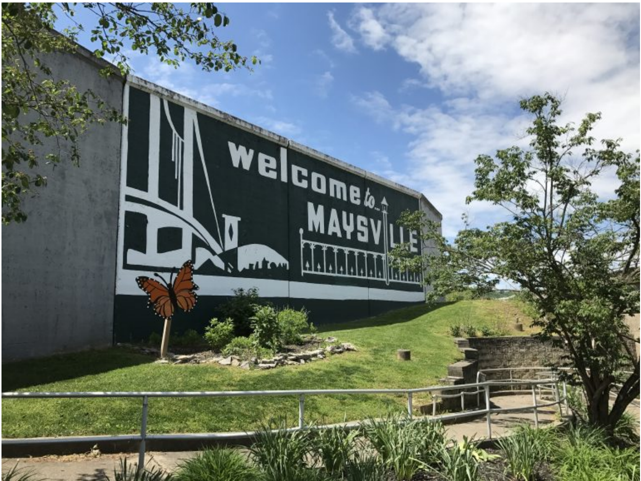
Welcome to Maysville