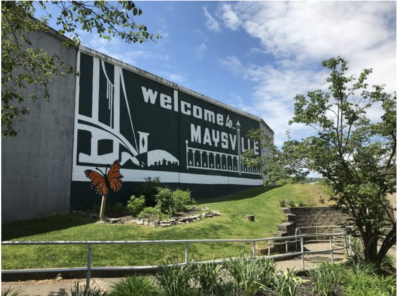
Welcome to Maysville